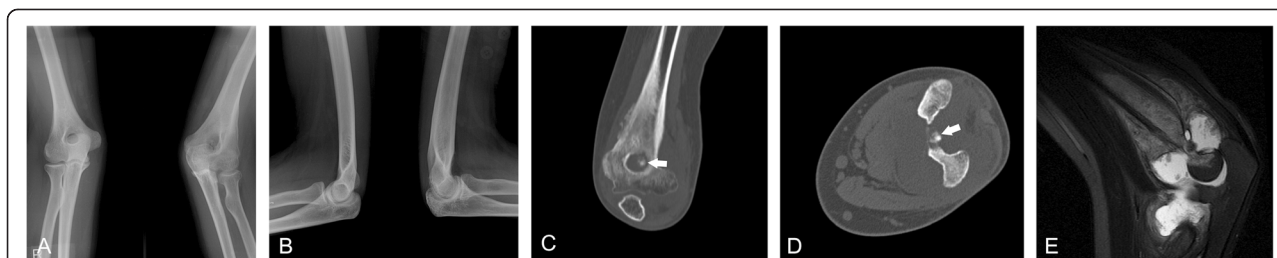
Figure 2 A 14.1-year-old boy with an intra-articular osteoid osteoma of the olecranon fossa with involvement of the elbow joint. (A, B) Anteroposterior (A) and lateral (B) radiographs show hypertrophic deformation around the left elbow joint. (C, D) Coronal (C) and axial (D) CT images demonstrate the nidus (arrow) at the olecranon fossa. (E) Sagittal T2-weighted MR image with fat suppression shows a heterogeneous intermediate signal intensity of distal humerus with a high signal intensity around the elbow joint indicating bone marrow edema with synovitis.

There are some limitations of this study that should be considered. First, the number of patients, especially with intra-/juxta-articular osteoid osteoma, was small. We suspect that prolonged hyperemia and synovitis due to diagnostic delay might have caused the severe hypertrophic deformation around the joint that led to permanent