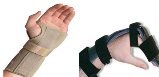
Fig. 1. Volar wrist cock-up and dorsal lock wrist hand orthosis

Patients reported their maximum pain at the start of the examination and at the end of 3 weeks after using splints