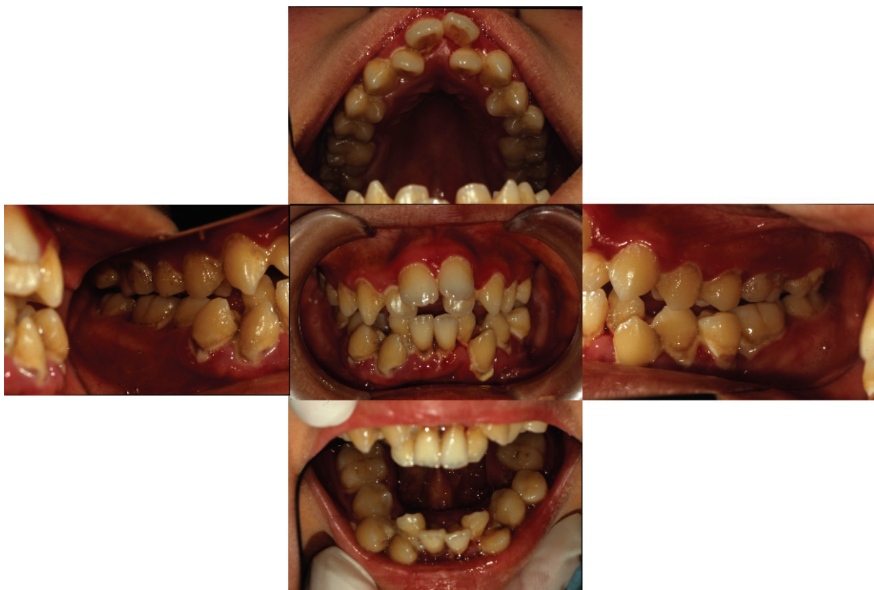
Figure 1 Intra-oral clinical appearance at initial visit.

An intra-oral examination revealed poor oral hygiene with heavy generalized plaque throughout the permanent dentition. His gingival tissues showed marginal redness, swelling, and food impaction (Figure 1). An apparent anterior open bite, increasing overjet, an anterior crowded arch and malpositioning of the teeth were noted. In addition, circular caries and attrition of the mandibular first molars were present. Pocket depths ranged from 4 mm to 8 mm. Mobility grade 2 was present in the mandibular left second premolar. We tried to measure the pocket depth and clinical attachment level at his first visit. Unfortunately, however, our patient did not allow the pocket measurement because of pain. Thus, we could not perform the conventional pocket measurement and examined only the mesial and buccal/labial pockets. Periapical radiographs disclosed localized vertical bone resorption (mesiolateral of maxillary right first molar and mesiolateral of mandibular left first molar) (Figure 2). Of particular note, the mesiopalatal pocket depth of the maxillary right first molar was 8 mm.