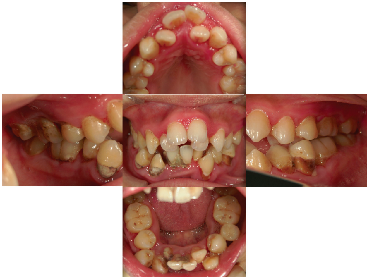
Figure 4 Clinical image at six months showing some improvement of gingival swelling.

Several researchers have reported severe periodontal diseases in patients with systemic genetic disorders such as Marfan syndrome (MFS), Ehlers-Danlos syndrome (EDS) and Down's syndrome (DS), which are accompanied by connective tissue disorders characterized by joint hypermobility and scoliosis. MFS is caused by mutations in the fibrillin-1 gene on chromosome 15q21.1, leading to abnormalities in the connective tissue matrix [8]. Straub et al. reported that inflammatory periodontal breakdown in a patient with MFS was caused by abnormalities in the periodontal connective tissue rather than being attributable to the primary biochemical changes of MFS [9]. EDS comprises a heterogeneous group of inherited connective tissue disorders characterized by joint laxity, chronic joint pain, skin hyperextensibility, tissue fragility and scoliosis [10]. EDS can be divided into 11 phenotypes, and periodontal diseases have been reported in EDS types I and VIII. The pathogenesises of these subtypes of EDS are unknown. The periodontal disease in EDS type I is localized,