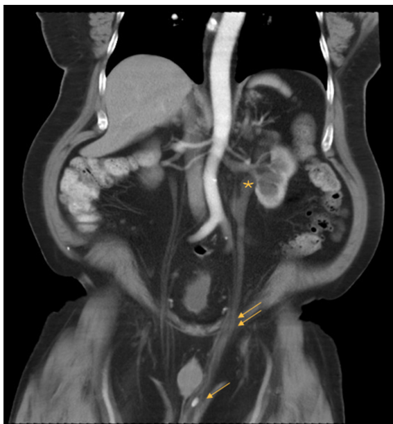
Figure 1 - Coronal contrast-enhanced CT in nephrographic phase demonstrating left hydroureteronephrosis (*). Dilated left ureter noted to pass through inguinal canal (double arrows) and into the left hemiscrotum containing a stone (single arrow).