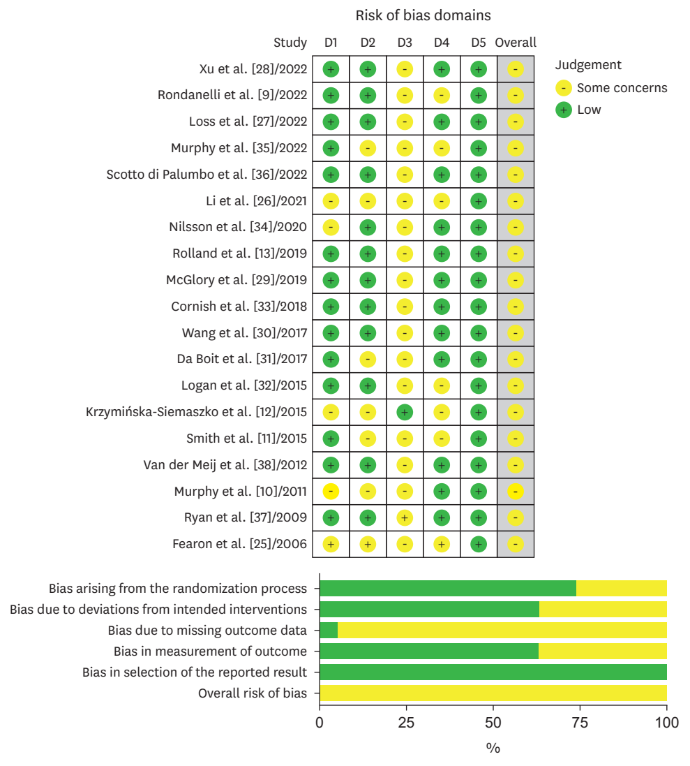
Figure 2. Bias assessment of studies conducting a randomized controlled trial. The risk of bias was assessed by reviewing the author's judgement according to the guidelines, and the percentage of studies belonging to a type of bias was presented. Risk of bias was assessed using a revised Cochrane risk-of-bias tool for randomized trials (ROB2) for randomized controlled trial studies.