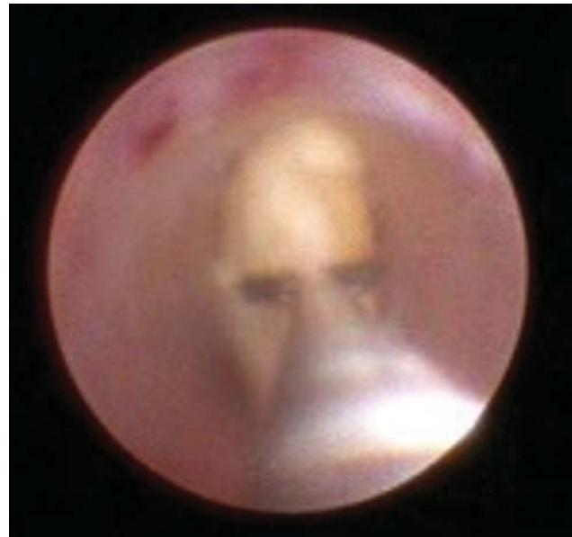
Fig. 3 Example of a duct with normal diameter, where it is possible to introduce and manipulate with tweezers. In this case, calculation of the salivary gland in the main duct being removed by forceps.