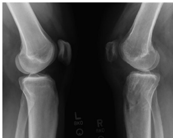
Figure 3. Three-month postoperative lateral radiographs of bilateral knees.

The patient was taken to the operating room, where an examination under anesthesia showed an intact ACL (Lachman test) and full range of motion. These findings, combined with the lack of additional injury seen on MRI, led to the decision to forgo arthroscopic examination. A midline incision was made over the patella down to the tibial tubercle, incorporating the incision from the initial BTB graft harvest. The patellar tendon had ruptured in the distal substance, leaving a 23-mm stump attached to the tibia on the medial side. The lateral side had a substantial amount of tendon still attached to the patella. Once the scar tissue was cleared and the patellar tendon was clearly identified, a separate medial incision was made to harvest the semitendinosus tendon with an open-ended tendon stripper, preserving the distal attachment to the tibia. The harvested tendon was delivered into the central wound under soft tissue. Once the harvested tendon was stripped of muscle tissue, a 4.0-mm drill hole was placed through the tibial tubercle below the attachment of the patellar tendon. The harvested tendon was then brought through the drill hole from medial to lateral and was incorporated into the proximal tendon stump in a Pulvertaft weave fashion along the inferior border of the patella. 13 Based on preinjury MRI, it