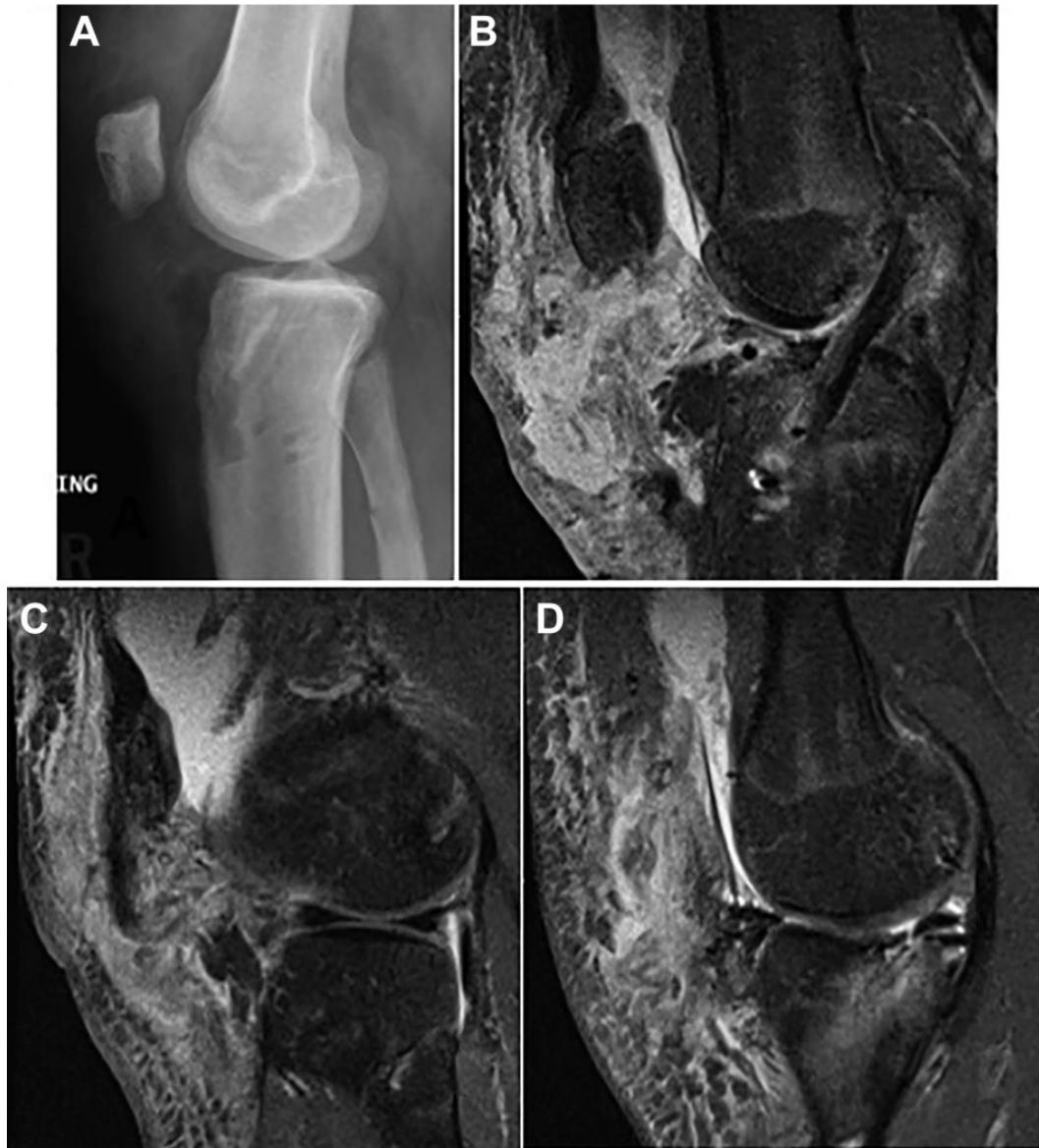
Figure 1. (A) Lateral radiograph showing the patella alta. Magnetic resonance imaging illustrates (B) rupture of the patellar tendon with an intact anterior cruciate ligament graft and a small medial stump attached to the tibia (C, D) as well as the lateral tendon still attached to the patella and an intact meniscal root repair.

school senior season. His examination was significant for a grade 2B Lachman classification and a positive medial McMurray test result. A magnetic resonance imaging (MRI) scan revealed complete tear of his ACL as well as a complex tear of the medial meniscus involving the meniscal root. Because of his desire to continue playing football competitively, he decided on a BTB autograft reconstruction with meniscal repair.