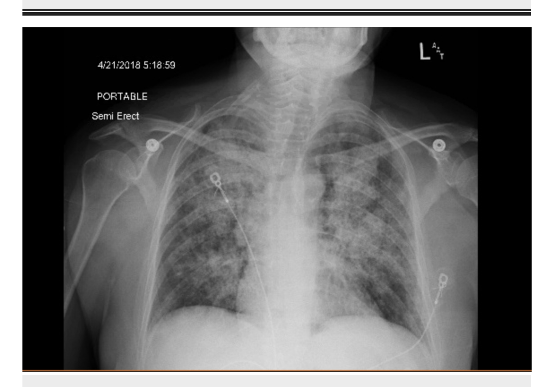
FIGURE 2: Repeat anterior-posterior chest X-ray obtained for increasing shortness of breath, showing diffuse multifocal airspace opacities consistent with acute respiratory distress syndrome