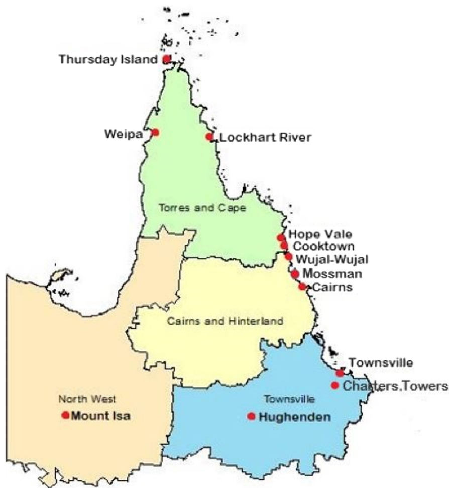
FIGURE 1 Map of research focus areas in North Queensland

numbers, a full assessment is not available. Cardihab ® is a commercial CR smartphone App that has been demonstrated to be effective, 21 but no information is published on access by people in R&R areas.