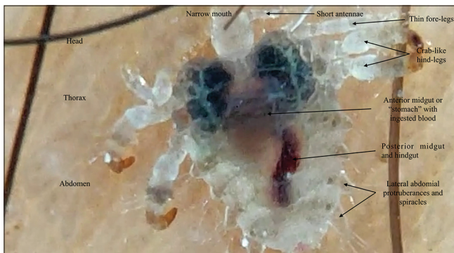
Figure 1: Adult crab louse on pubic hair. Respiratory spiracles and digestive system with ingested blood are clearly visible through the translucent exoskeleton (Dermlite II, hybrid M, 10×, polarized)