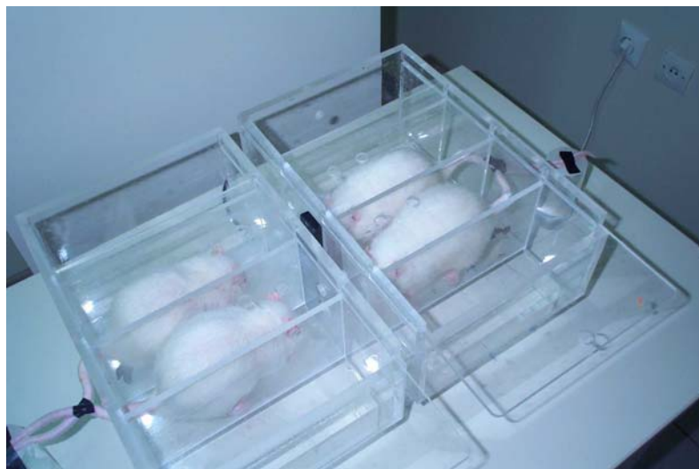
FIGURE 1. Plexiglas cages and animal arrangement around the antenna.

To develop the desired system, we constructed a generator of nonmodulated electromagnetic waves in the frequency of 910 MHz in our laboratory, with maximum output power 2.2 W. This construction was based on an oscillator and an integrated circuit from Mitsubishi Electric. Generated signals were channeled through a RG 58 coaxial cable to a Sirtel, minicell \lambda/2 dipole antenna. The selected antenna has the advantage to produce an EMF that its isotropy at the azimuth level permits a simultaneous radiation of circularly placed animals receiving the same radiation dose. The antenna is positioned between two specially designed Plexiglas cages that can hold up to four animals (two in each cage) with their heads facing the dipole (Fig. 1). The cages were arranged so that a 5-mm space existed between the cages and the antenna.