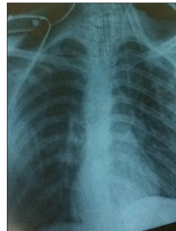
Figure 2: Chest X-ray on postoperative day 1 showing complete resolution of pulmonary edema

Acute pulmonary edema, a known but uncommon feature of pheochromocytoma, can be of cardiogenic (catecholamine-induced cardiomyopathy or myocarditis) [1] or noncardiogenic origin. Noncardiogenic edema can be caused by direct effects of catecholamines on pulmonary vascular bed that results in a transient increase in pulmonary capillary hydrostatic pressure or direct damage to alveoli and capillaries leading to increased pulmonary capillary permeability. [1,2] Several episodes of pulmonary edema in the absence of hypertension and left ventricular dysfunction in pheochromocytoma have been