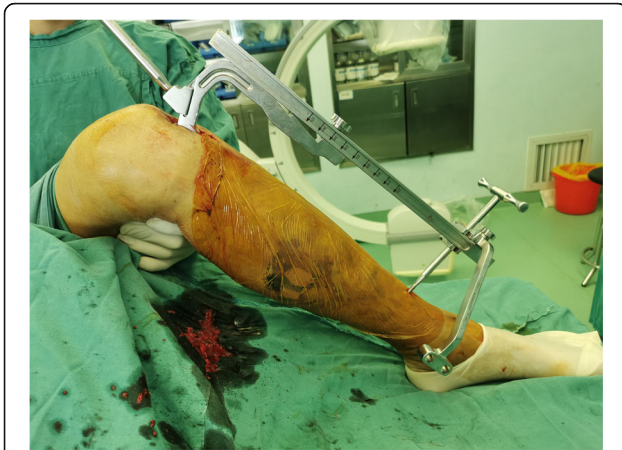
Fig. 5 In case of distal and proximal locking, a shift of posture is required in lateral position

currently the primary treatment of choice for most surgeons[2–5]. The main surgical approaches are infrapatellar and suprapatellar, which correspond to such surgical positions as supine with the knee hyperflexed and supine semi-extension. Surgical positions can have decisive impact on exposure and surgical flow, and can affect outcomes. An optimal surgical position facilitates surgical flow and exposure, shortens operation time, reduces bleeding, and protects the life of patients. There are some disadvantages to adopting the extreme knee flexion position when using the infrapatellar approach,