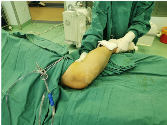
Fig. 3 Assistant's position during fracture reduction

by the assistant as the sum of gauze weighted plus the difference between the suction and irrigation volumes), number of assistants needed, complications (superficial infection, deep infection, malunion, delayed union, non-union, anterior knee pain), fracture healing time, and the Lower Extremity Functional Scale (LEFT) score[16] at 12 months after surgery.