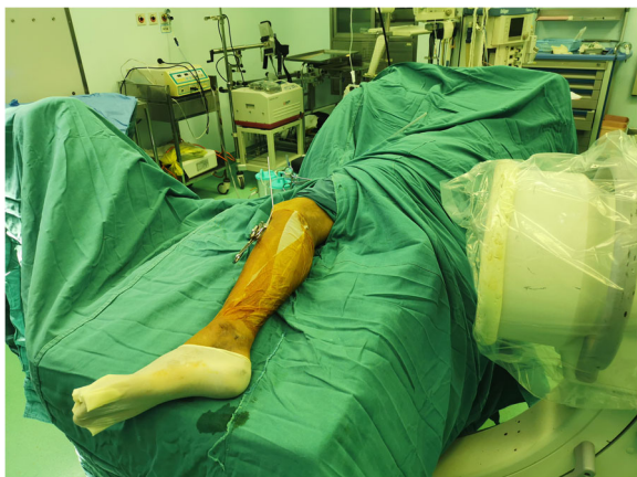
Fig. 4 Proximal tibial anteroposterior view during intraoperative fluoroscopy

According to the radiographic union score for tibial (RUST) fractures[17], fracture healing is observed when osteotylus appears on 3 of the 4 cortical bones. Delayed union is defined as imaging not meeting healing standards at 6 months postoperatively, and nonunion is defined if imaging demonstrates no healing after 3 months of dynamic observation. Fracture healing was assessed using the standard method. Rotation deformity was based on the clinical evaluation method: knee flexion by 90° in prostrate position. The difference between the