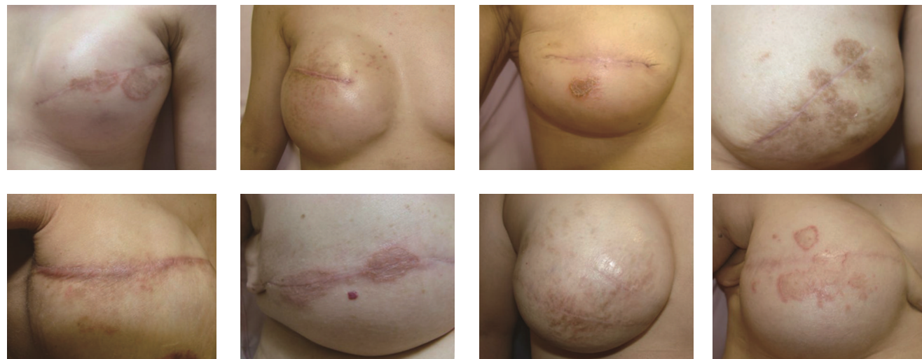
FIGURE 1: Representative cases of patients who developed nummular eczema after placement of tissue expanders and before replacement with silicone implants.