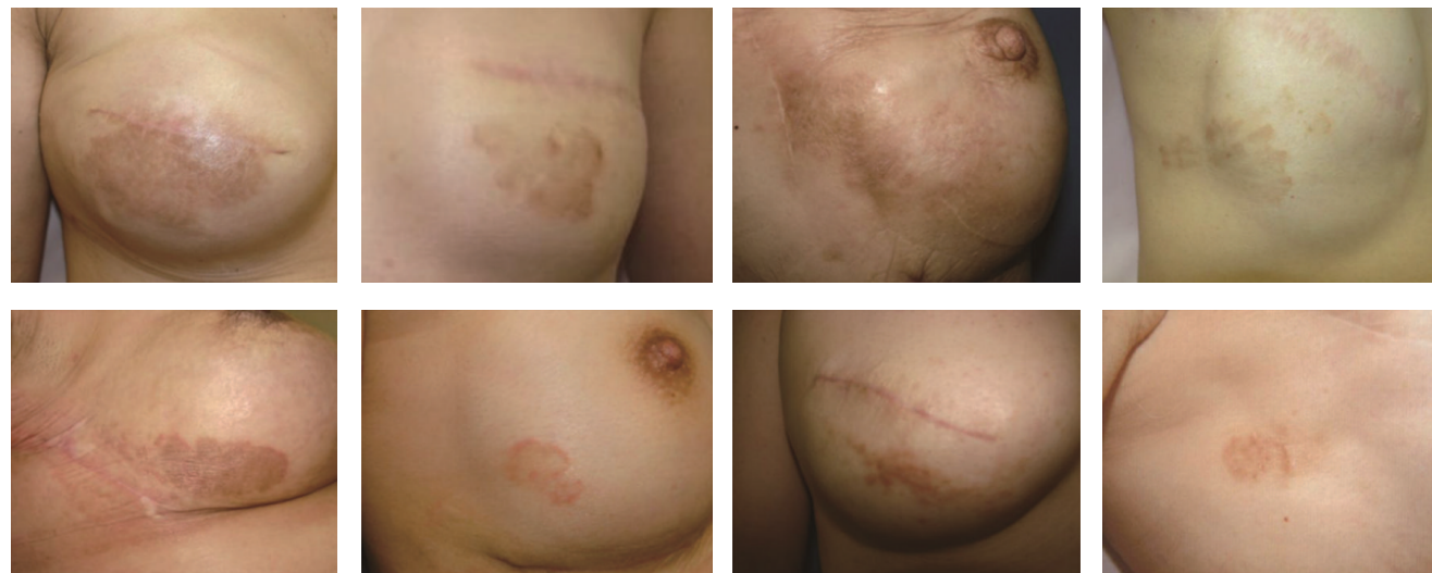
FIGURE 2: Representative cases of patients who developed nummular eczema after placement of silicone implants and before reconstruction of the nipple-areola complex.

In a majority of cases, nummular eczema healed within three to four weeks with the administration of steroid ointments (betamethasone valerate). In no cases did nummular eczema further deteriorate to cause ulceration or chronic infection after application of steroid ointment.