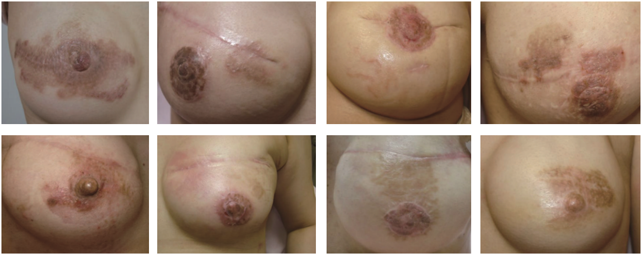
FIGURE 3: Representative cases of patients who developed nummular eczema after reconstruction of nipple-areola complex.