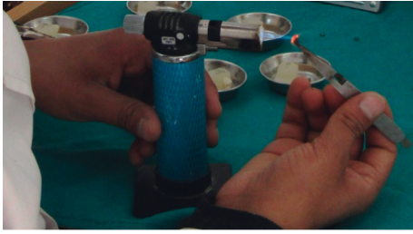
FIGURE 1: Flaming of brackets.