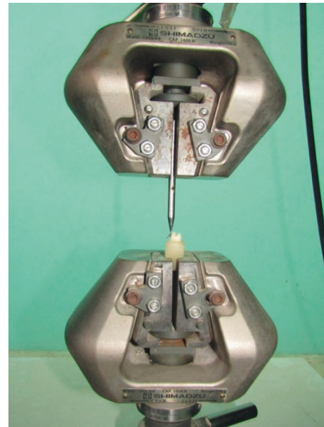
FIGURE 4: Close view of crosshead of the universal testing machine with sample in situ.

software, version 21.0 (SPSS Inc. Chicago, Illinois, USA), where descriptive statistics, analysis of variance, and Tukey's post hoc multiple comparison test were used and statistical significance was set at p less than 0.05. The Kolmogorov–Smirnov test and the Shapiro–Wilk test were used for test of normality.