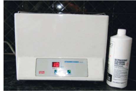
FIGURE 3: Ultrasonic cleaning of brackets.

After bond strength testing, all specimens were collected and visually examined using a stereomicroscope (Olympus SZX12; Olympus corp., Tokyo, Japan) at 10X magnification to assess the adhesive remnant index [15, 22] available at Nepal Agricultural Research Council (NARC), Khumaltar. The adhesive remnant index was used to evaluate the amount of resin remaining on the tooth after debonding. At the beginning of the experiment, assessment of intraobserver reliability was done for which the entire procedure was performed by single person and the observation of shear bond strength was also done by the same observer where twenty percentage of samples from each group were randomly selected and subjected to respective methods of recycling. Shear bond strength was recorded using a universal testing machine ( T_1 ). Same procedure was repeated after 2 weeks of the first observation, and shear bond strength was recorded ( T_2 ). The data were processed and analyzed using the Statistical Package for the Social Sciences