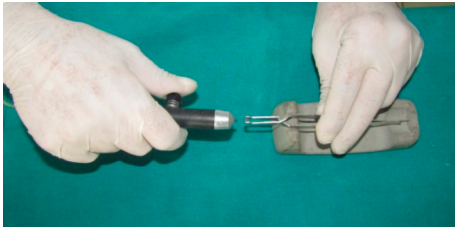
FIGURE 2: Sandblasting of brackets.

Composite was removed from the tooth surface with sixteen fluted tungsten carbide bur in unidirectional movement [21] with a water cooling system until there was no visible adhesive remaining on the tooth surface [20]. All recycled brackets were bonded to teeth using the standard bonding procedure as described above. All samples were stored in distilled water until final debonding was performed. Final debonding was performed immediately after 24 hours of bonding to standardize shear bond strength in a universal testing machine [11, 12, 15] (AG-IC/100 KN, Shimadzu, Japan) (Figure 4) available at the Nepal Bureau of Standards and Metrology, Balaju, at a crosshead speed of 0.5 mm/min [15]. The force required to dislodge the brackets was measured in Newton, and the shear bond strength (MPa) was calculated by dividing the force values with the bracket base area of 11.6 mm 2 .