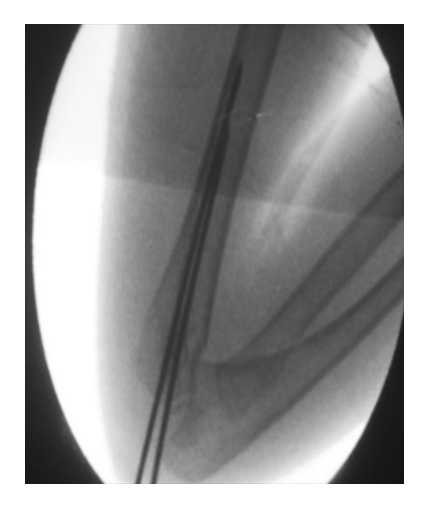
Fig. 3 Reduction confimation in Lat. view

6 months. In the third week, the pins were removed without anesthesia. At 3- and 6-month follow-up, the children were evaluated for full function, minor limitation of function and major loss of function.