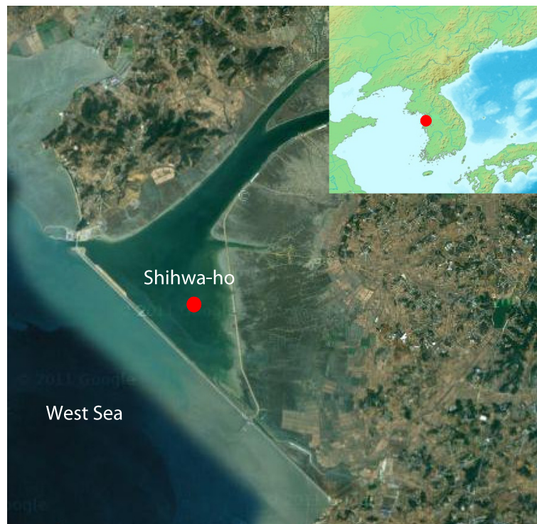
Figure 1 Location of sampling site of Md/SH38-45 (H13N2) virus in South Korea (inset map). The wetland site, Shihwa-ho, is a reclaimed lake adjacent to the West Sea in South Korea (larger map).

The present analyses revealed that internal genes, polymerase subunit PB2 (PB2), polymerase acidic (PA), nucleoprotein (NP) and nonstructural protein (NS)