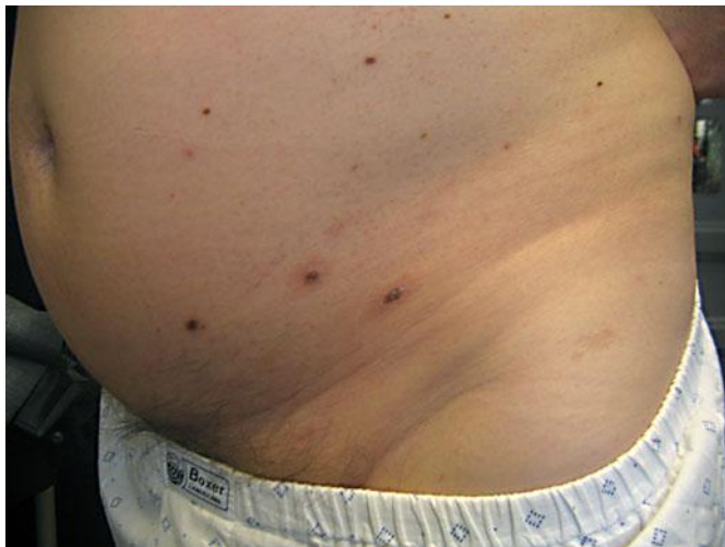
Fig. 1. Melanocytic nevi with epidermal scaling and an erythematous perinevic halo.

The authors declare that they have no conflict of interest.