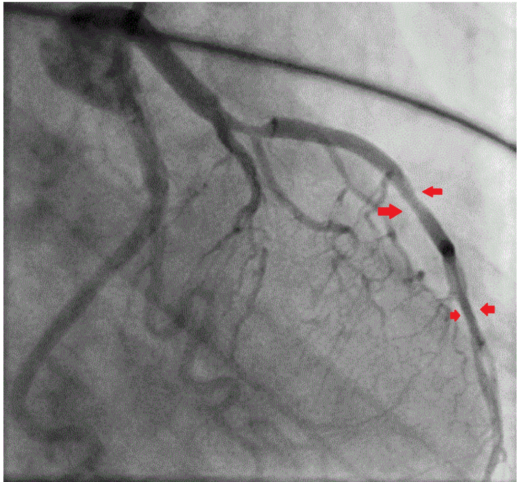
FIGURE 2: Coronary angiography showing the mid-left anterior descending artery 70% and the distal left anterior descending artery 60% lesion but with good flow in the left coronary artery system (shown by the free flow of contrast)

Intraoperative echocardiogram showed corresponding wall motion abnormalities (WMA) involving the anterolateral wall of the left ventricle. Optical coherence tomography (OCT) showed uninterrupted intima with no evidence of plaque rupture, erosion, luminal thrombus, or acute occlusion (Figure 3).