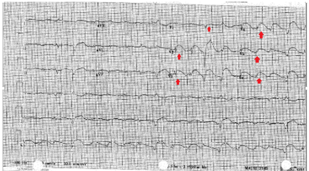
FIGURE 1: Electrocardiogram on presentation showing diffuse, convex ST-segment elevations in leads V1 to V6

hyperlipidemia, or smoking. Family history was also unremarkable. However, EKG upon transfer showed anterolateral ST-elevations in leads V1-V6 (Figure 1).