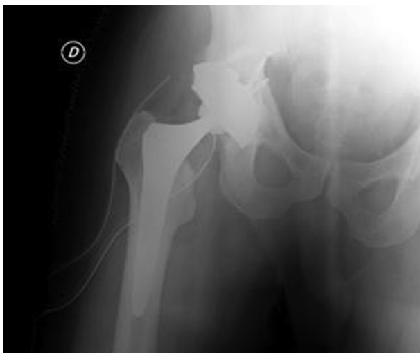
Fig. 2. Same case as in Fig. 1. Postoperative pelvic X-ray film: THA with Revision Shell cup, augment and 4 screws.

Instead, more recent studies focus on the bone cells and matrix changes. Goodman, Sengupta and Prathap, 19 found hypocellularity in irradiated human bone sections, with unaltered blood vessels.