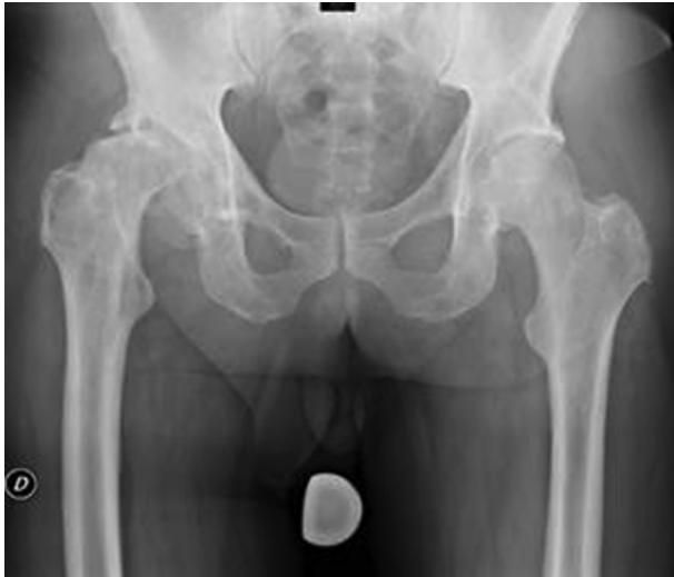
Fig. 1. Pelvic preoperative X-ray film shows evidence of postradiation arthritis. Note the sclerotic bone in the superior acetabular zone.

With this study, we sought to determine the midterm survival rate of tantalum acetabular cups implanted directly on irradiated bone in patient with history of musculoskeletal tumor. Furthermore, we evaluated the functional outcome and radiographic follow-up.