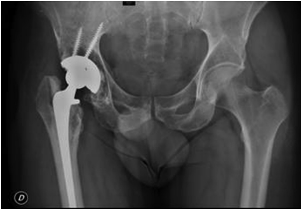
Fig. 4. Pelvic x-ray film performed 96 months postoperatively shows revision shell cup fixed with screws. Radiolucent lines are present in zone 2 and 3. Patient did not refer for any discomfort.

They also proved how osteoblasts are generally more sensitive to radiation than the osteoclasts.