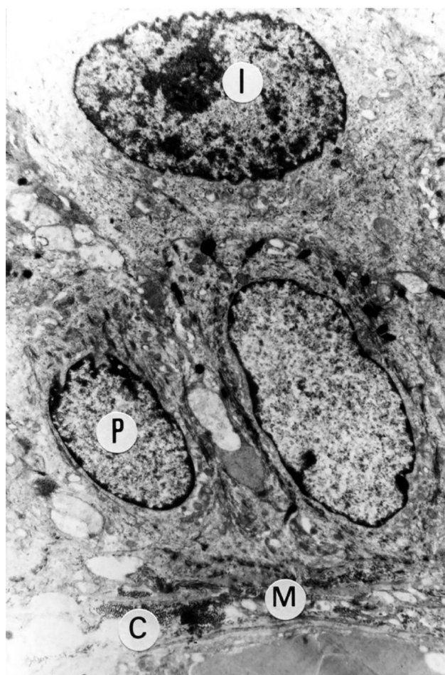
Figure 1. TEM of case No. 19, image showing ultrastructural appearance of neovaginal mucosal lining, similar to a normal mucosal lining, presenting chorion (C), basal membrane (M) and, in this epithelium, deep (P) and intermediate (I) layer cells are noted. Cytoplasmic and cell organelle characteristics are similar to those of a normal epithelium. Image size increased 7,300 fold.

This study included 26 patients; data are shown on Table 1. The ER determination in the epithelium of neovaginas was evidenced in variable levels of intensity,