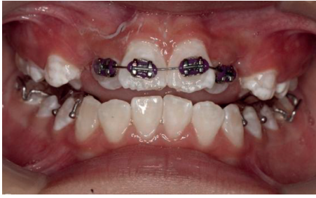
FIGURE 9: Sectional short-span wire-fixed orthodontic appliance in place during treatment.