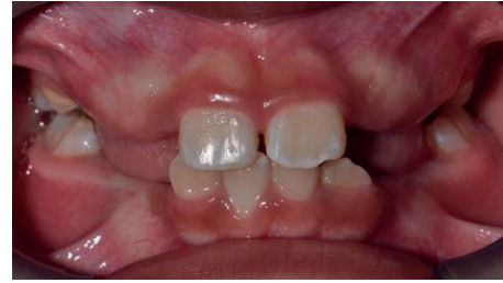
FIGURE 6: Posttreatment photograph at 6 months after correction of the anterior crossbite.