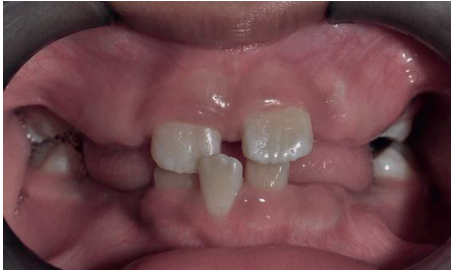
FIGURE 4: Pretreatment photograph of tooth 11 in crossbite.