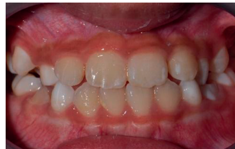
FIGURE 3: Posttreatment photograph at 3-month review after correction of the anterior crossbite.

Intraoral examination showed all primary teeth of the patient missing due to the previous extraction. Both the permanent maxillary and mandibular first molars on either side have erupted into occlusion. Anteriorly, the permanent maxillary right central incisor (tooth 11) was in a crossbite with the permanent mandibular right central incisor (tooth 41). In occlusion, tooth 11 was trapped between tooth 41 and the permanent mandibular right lateral incisor (tooth 42) (Figure 4). Tooth 41 has Class II tooth mobility and gingival recession on its labial aspect.