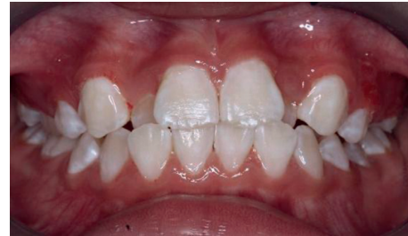
FIGURE 7: Pretreatment photograph of tooth 12 and 22 in crossbite.

central incisor (tooth 21). A short Ni-Ti 0.014" round archwire was placed into the brackets and held in place with elastic ties (Figure 5).