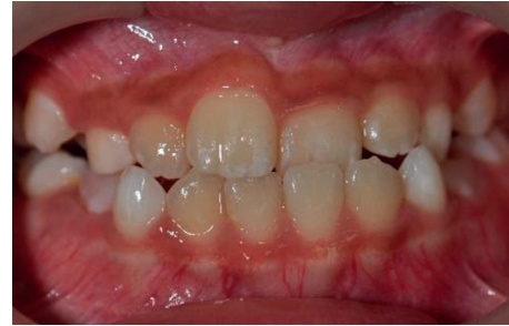
FIGURE 1: Pretreatment photograph of tooth 12, 21, and 22 in crossbite.

2.2. Case 2. A 7-year 2-month old boy was seen in the Paediatric Clinic at the Faculty of Dentistry, National University of Malaysia (UKM), for routine dental assessment. He had previous dental treatment under general anaesthesia two years ago, and his medical history was noncontributory.