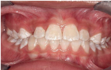
FIGURE 10: Posttreatment photograph at 6 months after correction of the anterior crossbite.

cases are of dental origin [21]. Possible causes of dentally related anterior crossbite are the presence of supernumerary tooth/teeth, odontomas, trauma to the primary predecessor, ectopic position of permanent tooth germ, retained primary predecessor, anomalies in tooth shape and size, arch length inadequacy, and upper lip biting habit [7, 13, 14]. These dentally related factors are responsible for deflection of the normal eruption path of the permanent successor tooth/teeth.