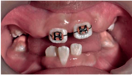
FIGURE 5: Sectional short-span wire-fixed orthodontic appliance in place during treatment.