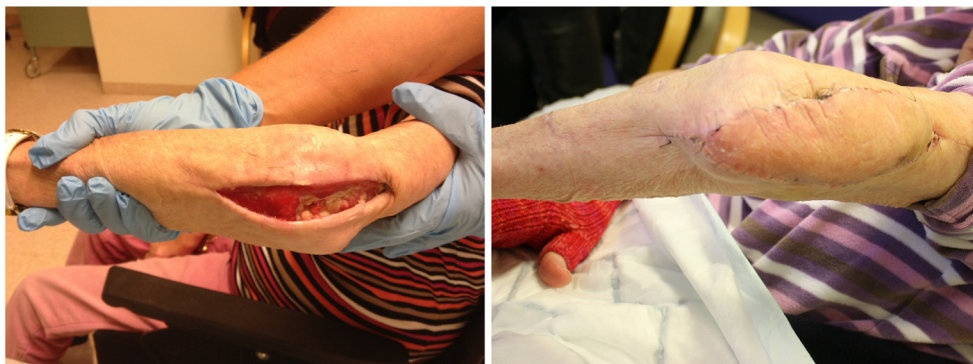
Fig 3 An example of a “propeller” design flap for a chronically exposed elbow fracture

The flaps were inset with a combination of a resorbable polyglactine and nylon suture, and the donor site closed primarily in a linear fashion. Drains were not routinely used. Light dressings were applied, and the patient was discharged at the day of surgery or the following day depending on the indication and general medical condition.