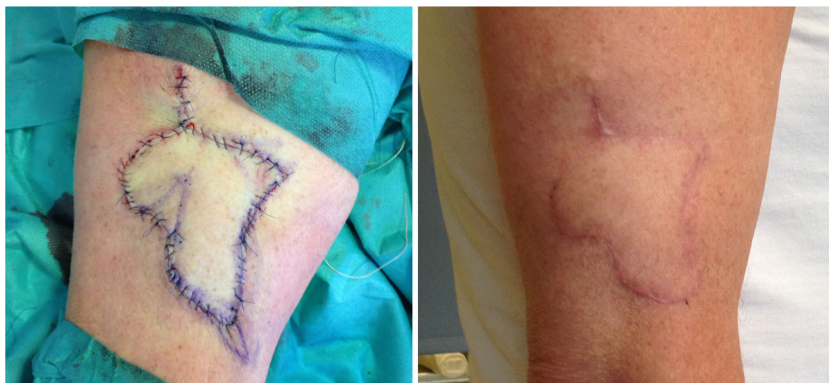
Fig 4 An example of the multilobular “cogwheel” design

The freestyle flap concept was first introduced in 1983 by the Finnish surgeon Asko-Seljavaara [9]. It refers to the wide array of perforators that can safely supply a skin flap within the given perforasome [7]. The perforator located nearest to the defect allows for the shortest angle of rotation and simplest flap design. The pedicled perforator flap is a good option for reconstruction of the moderate-sized defect as it is most likely within the safe boundaries of the chosen perforasome and the donor site can be closed directly. The perforators were consistently found where to be expected by anatomical description [6, 7] and readily localized with CDU. When the perforator was localized, the flap was simply released to allow for the necessary range of rotation without any tension. As opposed to most published series, the perforator was not dissected down to the axial vessel [10–12]. We have used several different flap designs, ranging from a simple ellipse (Fig. 3) to a multilobular flap, which we call a “cogwheel” flap (Fig. 4). Our experience so far indicates that the technique is simple and reliable despite a limited