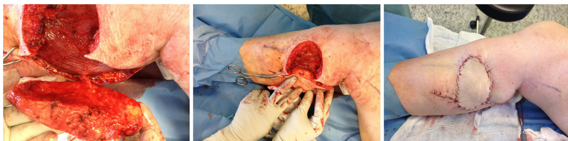
Fig 2 Intraoperative exploration. The defect is extended in a subfascial level until a suitable perforator is found and then the flap is designed around it

We used a BK Medical color Doppler ultrasonographer with a 10–12 MHz linear transducer. The settings were set for small peripheral vessels and low flow velocity to enable detection of flow in the perforators. Skin availability adjacent to the defect was evaluated in terms of possible flap options. Once identified, the area of interest was examined moving the transducer very slowly until a pulsating perforator was identified at the deep fascia level. Perforators in the area were mapped according to size and located with a permanent marker. The skin flap was subsequently designed to include the biggest perforator available and preferably to allow the least possible angle of rotation including as many perforators as possible in the design.