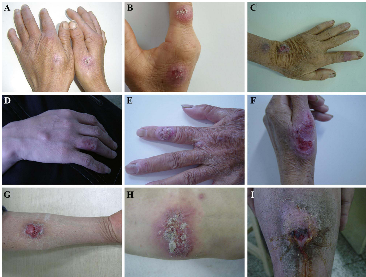
Figure 1 Clinical manifestations of sporotrichosis in a patient. (A) Crusted plaques on the dorsum of both hands. (B) Crusted plaques on the dorsum of the hand. (C) Fluctuating nodules on the left upper extremity. (D) Solid nodules distributed along lymphatic vessels. (E) Verrucous nodule with scaling on the extensor aspect of the right finger. (F) Plaques with central erosions and crusted margins on the dorsum of the hand. (G) Plaques with slightly raised margins and central pitting. (H) Linear red maculopapular eruption with ulceration and thick crusts on the right upper extremity. (I) Infiltrative ulcer with crusting on the extensor aspect of the right lower extremity.

Many patients were unable to recall a specific trauma history, probably due to the several-month incubation period of Sporothrix or the potential for even minor abrasions to cause infection, leading to vague patient recall.