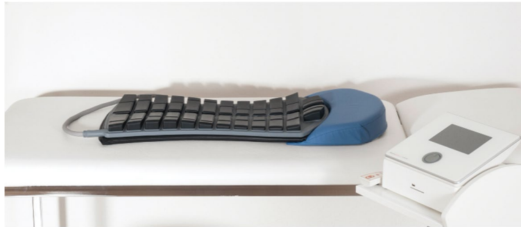
Fig. 2 StimaWELL 120MTRS system

movers composed of a majority of type II fibers. We are choosing the phasic setting because some research has shown an increase in stiffness in the superficial multifidus (SM) in CLBP patients 9 , which contain a greater proportion of type II fibers in healthy individuals. The increase in stiffness could reflect a shift towards type I fiber composition in the SM in CLBP patients. Therefore, parameters which selectively target type II fibers might help reverse this process. During the initial calibration and throughout the treatments, the current intensity will be increased so that participants feel a strong but comfortable contraction. This standard of current intensity will always be maintained, although the actual output may vary over the course of treatment.