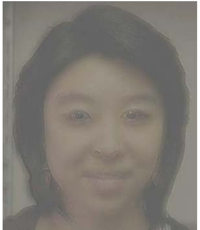
Figure 4. Student's “ Mona-Lisa Effect ” experiment. Smiling and neutral expression images were passed through low and high-spatial frequency filters respectively. The merged image is shown. When viewed closely or from a distance, the image appears to alternate, respectively, between the neutral and smiling expressions. The same phenomenon occurs when, at a close viewing, the observer shifts her gaze between the eyes (smiling) and the mouth (not smiling).

Through student-directed inquiry, the students uncover an understanding of the neural basis for the Mona Lisa effect. They use their knowledge of the visual system, along with their nascent problem-solving skills to uncover an explanation and avenues for further research. They determine that the organization of the retina accounts for much of this “ Mona Lisa ” effect: the periphery of your visual field is sampled by a lower concentration of photoreceptors and a higher degree of photoreceptor pooling by ganglion cells, and as such is specialized to detect low-spatial frequencies (coarse information). The fovea, on the other hand, contains a higher density of photoreceptors and a photoreceptor-to-ganglion cell ratio close to unity; it is thus specialized for high-spatial frequencies (fine details). Da Vinci painted Mona Lisa 's smile using shadows that are detected best by our peripheral vision. Consequently, when a viewer's gaze is directed away from the mouth, such as at the eyes, the