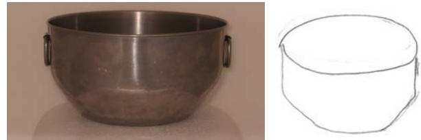
Figure 6. Shape constancy. A drawing of the pictured stimulus exaggerates certain features.

Inspired by her studio experience, a student in the course, Colleen Kirkhart, investigated a common drawing mistake caused by shape constancy. When faced with the task of drawing a cup or a bowl from the side, inexperienced students tend to render the top as more circular than they ought to be (Fig. 6). The student knows the object itself is circular and draws it as such, despite the fact that the retinal projection is of a narrow ellipse.