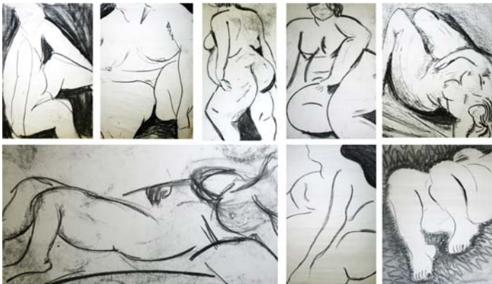
Figure 5. Drawing samples from life drawing studio session. A given retinal ganglion cell measures the pattern of brightness (relative luminance) across its receptive field rather than the absolute value of light falling on it (luminance), making our visual system much more sensitive to local changes across the visual field, such as edges, than gradual ones. As a result, we spend more time looking at edges and students tend to overwork marks demarcating edges.

Some students express concern with their lack of experience, but the mistakes common to inexperienced artists prove particularly useful for classroom discussion (provided all the students are comfortable). The students discover that the visual experience of a work in progress is fundamentally different from that of a final product. How does the way we process visual information shape art practice? The artist is charged with making a stimulus for consumption by the visual system of another person, yet must do so having access only to the products of their own visual system. If we consider the visual system as a processor of information, it is as if artists must provide the raw materials to the processors of viewers yet only have access to the processed product of their own system. Anya Hurlbert has discussed how this problem poses a particular challenge in capturing color constancy using Monet’s Rouen Cathedral paintings as examples (Hurlbert, 2007). The result of this dilemma is manifest as common errors in naïve drawings; and the errors therefore provide insight into how our brains are handling visual information.