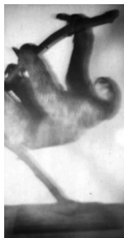
Figure 2. Picture of a stuffed sloth taken by a student with a pinhole camera made with household materials during a lab activity. To review the principles of optics, students design and build pinhole cameras from materials they bring to class. They grapple with questions such as: Why is the projected image upside down? What governs exposure time? And how do you determine your camera's focal length?

The physical principles that govern how light interacts with the visual system are investigated in several lab activities: a cow-eye dissection and subsequent examination of its lens properties using light sources and an optic bench; the fashioning of pinhole cameras to study optics (Fig. 2); and the use of a spectroradiometer (PR-655 SpectraScan, Chatsworth, CA) in the assessment of perceptual judgments of achromatic brightness gradients (the relationship between luminance and brightness) and the measurement of the spectral composition of different common light sources.