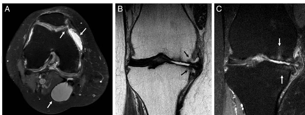
Figure 3 MRI in individuals with symptomatic knee osteoarthritis illustrating the structural abnormalities that discriminate symptomatic knee osteoarthritis best. (A) Axial fat suppressed proton density (PD) MRI showing a Baker's cyst, effusion and an osteophyte in the medial trochlear facet. (B) Coronal PD MRI showing osteophytes in the medial femoral condyle and medial tibial plateau. (C) Coronal fat suppressed PD MRI showing BMLs in the medial femoral condyle and medial tibial plateau. BML, bone marrow lesions.

Funding The NEO study is supported by the Dutch Arthritis Foundation (project number 10-1-309), the participating Departments, the Division and