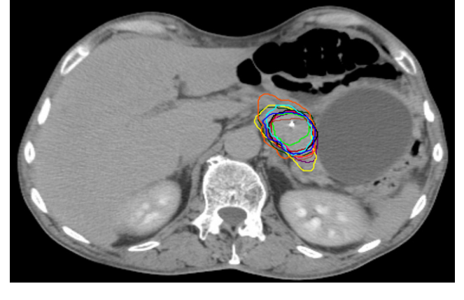
Fig. 1 Gross tumour volumes ( GTVs ) of one institution ( red ) and internal gross tumour volumes ( iGTVs ) of 10 institutions projected on the average scan of the four-dimensional computed tomography ( 4DCT ). One intratumoural fiducial marker is visible within the delineated target. Colours: institution 1: orange ; 2: yellow ; 3: light blue ; 4: green ; 5: pink ; 6: dark green ; 7: brown ; 8: dark blue ; 9: black ; 10: red , 11: purple