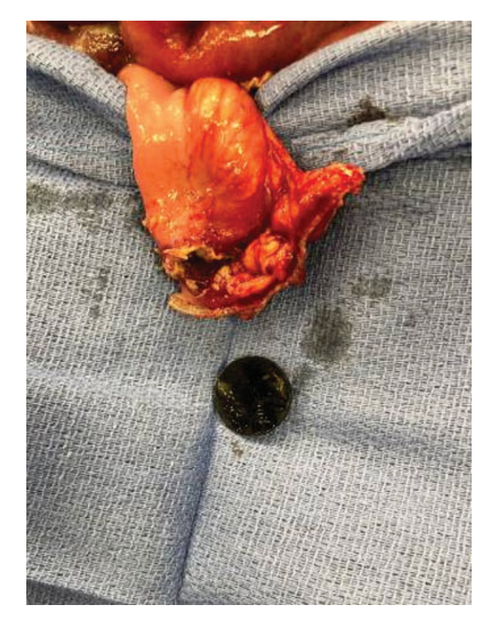
Fig. 2 Intraoperative photo of the 21 mm disc battery where it had eroded and perforated the anastomosis. Note the significant acute and chronic inflammation of the bowel.