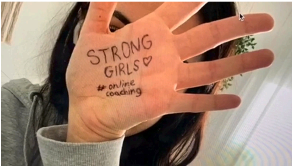
Fig. 6. Still from Elance Academy online coaching video.