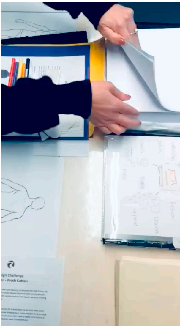
Fig. 13. Still from Rambler preparing home design kits, Amsterdam.

Rambler-Amsterdam prepared design kits for young members to take home, keeping them 'creating' and 'designing' their daily lives in lockdown (see Fig. 13). Ramblers were encouraged to share and stay connected through social media with the hashtag #designyourdailylife (#DYDL), not knowing if/when they would be together again in the studio, but ensuring that they were not working alone but, instead,