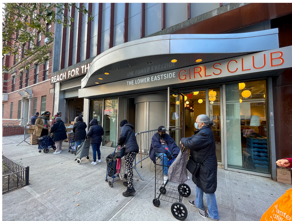
Fig. 1. Line outside Lower East Side Girls Club, New York City.

Amsterdam had been considerably less impacted by COVID-19 in the first wave that worsened significantly with the arrival of a second wave. From March 2020 to early July, Amsterdam followed national guidelines for an 'intelligent lockdown,' including the closure of schools, restaurants, bars and gyms; working from home for all citizens except essential workers; and a 1.5-m social distancing rule (except for in the