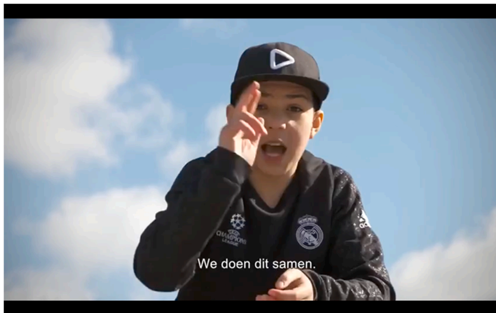
Fig. 2. Still from youth awareness raising video in Dutch ("We can do this together").