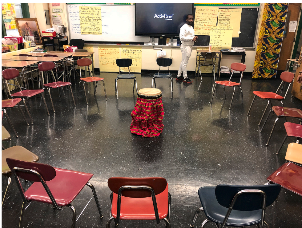
Fig. 8. "Mbongi," Ifetayo, Brooklyn.

The COVID-19 outbreak thus meant a re-valuing and re-defining of safe spaces. Initiatives had to place greater emphasis on the materiality of spaces, now viewed increasingly through the lens of physical health. Whereas previously safe spaces enabled a sense of social and mental