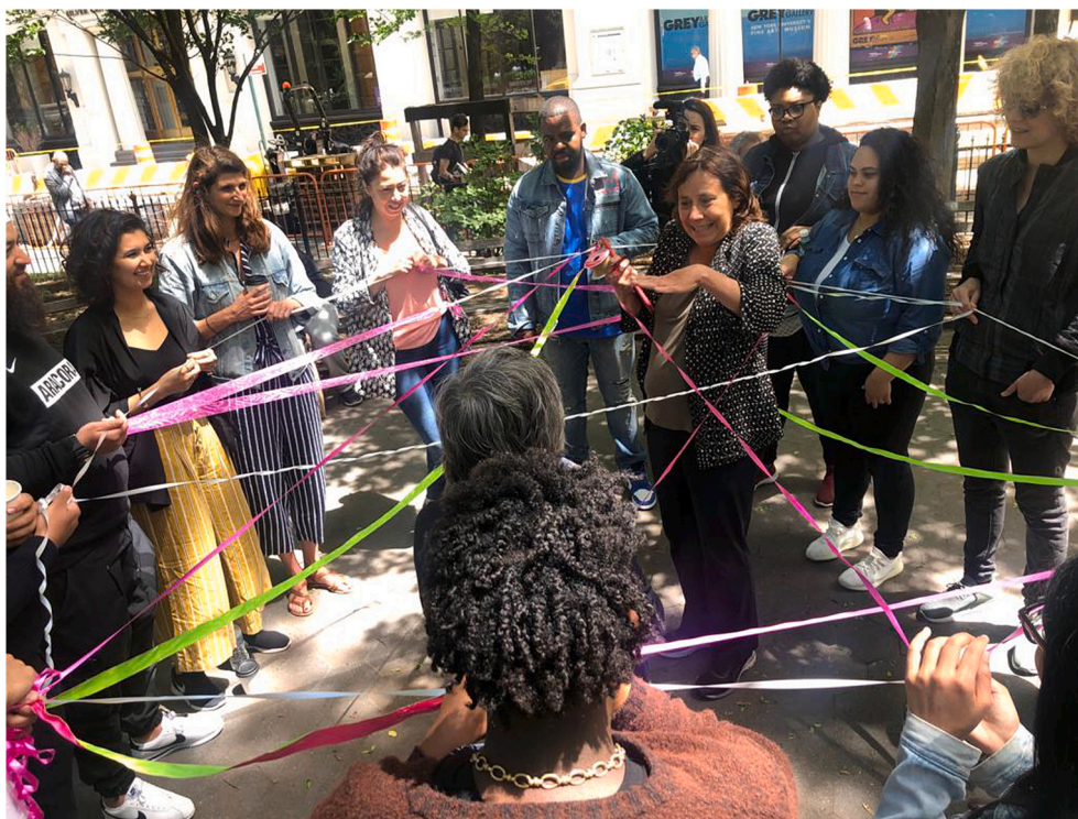
Fig. 3. Still from NYC kick-off meeting after movie: https://vimeo.com/381913933.

sharing updates from and between the initiatives, and sustaining data collection in this new evolving landscape.