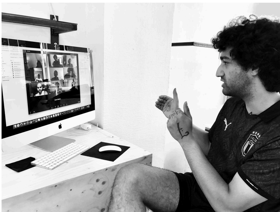
Fig. 11. NYC Ramblers meet Amsterdam designer at Rambler Studios.

With “normal life” radically changing via extended lockdown in both New York City and Amsterdam, it became painfully clear that many young people would be exposed to many stressors associated with being socially distant (and isolated). In order to prevent or reduce these potential traumas as health risk factors later in life, many of the participating organizations took action to offer creative outlets for youth