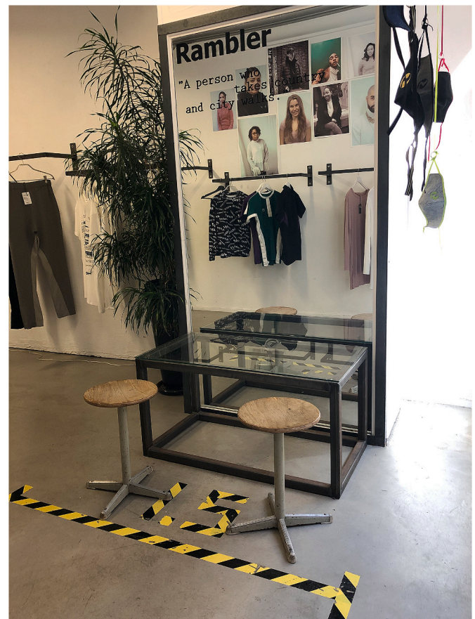
Fig. 7. Keeping 1.5m distance, Rambler studios, Amsterdam.

Across many of the youth initiatives, gender-specific safe spaces are common, including girls-only and boys-only programs. In Amsterdam, GirlsConnect has long organized soccer training for girls, many of whom