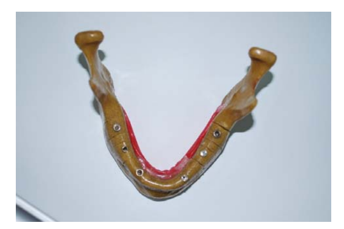
Figure 1. The implant drilling model used in the study.

The second series of scans were carried out by Planmeca Promax 3D Max CBCT (Planmeca OY, Helsinki, Finland) in a private oral and maxillofacial radiology clinic in Tabriz. This x-ray machine uses a cone x-ray beam, with 1900 \times 1516 pixel flat panel detector, a rotation of 270°, a pixel size of 0.127 µm and a 84 kVp. The scans were carried out under the following exposure conditions: kVp84 kVp, exposure time of 12 seconds and 12 mA.