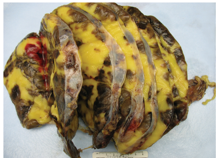
FIG. 2. Gross specimen of the adrenal mass.