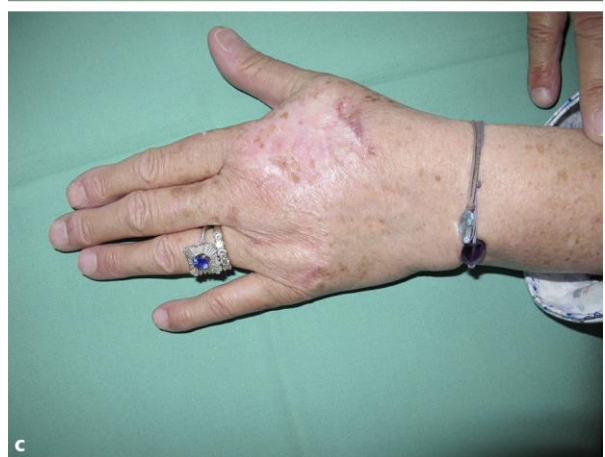
Fig. 1. Clinical pictures before and after treatment. a Patient at presentation with the fourth recurrence in 3 months of a skin lesion on the back of the left hand. b Recurrence after radiotherapy. c Cure after intralesional injections of triamcinolone acetate.