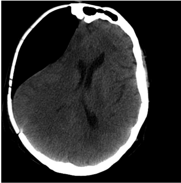
Fig. 1 – Axial noncontrast CT (NCCT) head at the level of the midbrain demonstrating large amount of extra-axial air resulting in midline shift.