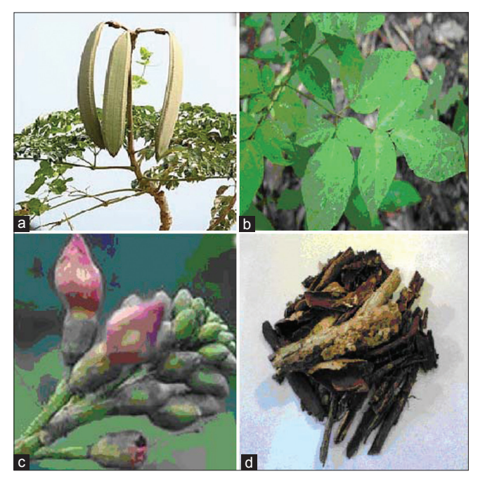
Fig. 1: Oroxylum indicum: (a) tree (b) leaves (c) flowers (d) wood bark

Roots are sweet, astringent, bitter, acrid, refrigerant<sup>[9]</sup>, antiinflammatory, anodyne, aphrodisiac, expectorant, appetizer, carminative, digestive, anthelmintic, constipating, diaphoretic, diuretic, antiarthritic, antidiabetic and febrifuges. Tonic is useful in dropsy, cough, sprains neuralgia, hiccough, asthma, bronchitis, anorexia, dyspepsia, flatulence, colic, diarrhea, dysentery, strangury, gout, vomiting, leucoderma, wounds, rheumatoid arthritis and fever. Root bark is used in stomatitis, nasopharyngeal cancer and tuberculosis<sup>[4,10]</sup>. Leaves are used as stomachic. carminative and flatulent. Leaf decoction is given in treating rheumatic pain, enlarged spleen<sup>[4]</sup>, ulcer, cough, and bronchitis. Mature Fruits are acrid, sweet, anthelmintic, and stomachic. They are useful in pharyngodynia, cardiac disorders, gastropathy, bronchitis, haemarrhoids, cough, piles, jaundice, dyspepsia, smallpox, leucoderma and cholera<sup>[3]</sup>. Seeds are used as purgative. Dried seed powder is used by women to induce conception. Seeds yield non-drying oil used in perfume industry. The seeds are ground with fire soot and the paste is applied to the neck for quick relief of tonsil pain. The seeds are used in