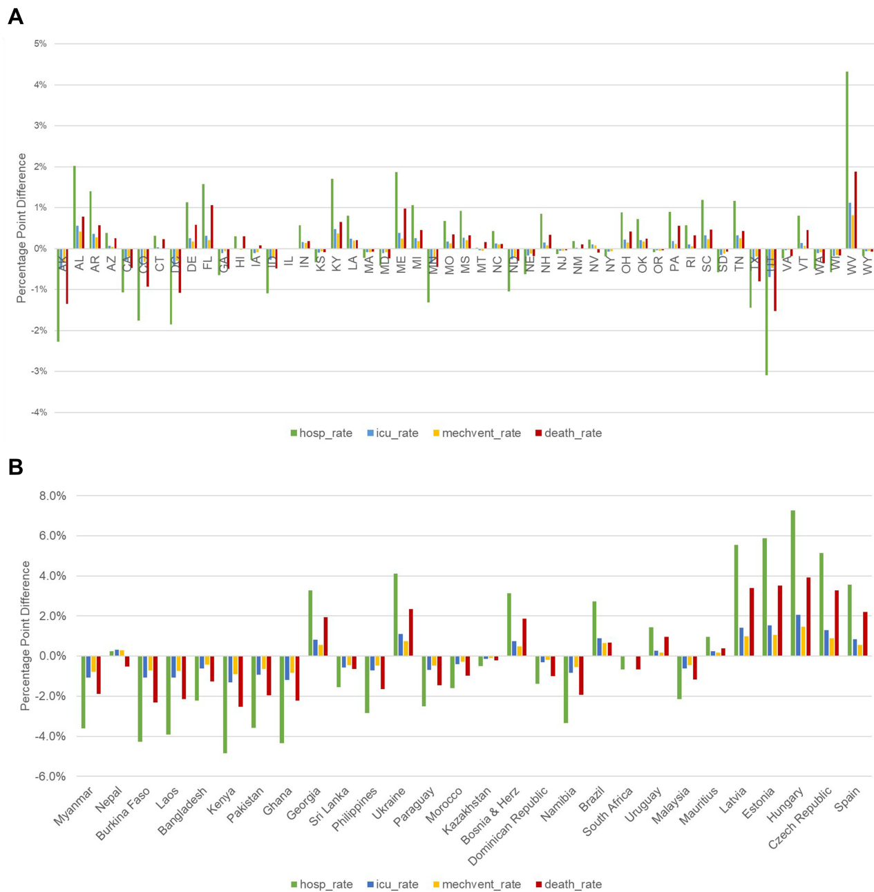
Figure 1 COVID-19 health outcomes in US states (Panel A ) and across a subset of nations (Panel B ) relative to national averages.

by the number of cases based on data 24 as of June 12, 2020 (see Figure 2 : Panel A and Panel B). For the US states, we can see that the predicted death rates based on age and comorbidities are higher than actual death rates, sometimes by several percentage points. The Pearson correlation coefficient for US states is -0.015 . For the international comparison, there is also a slight systematic over-prediction, with a Pearson correlation coefficient of 0.515 .