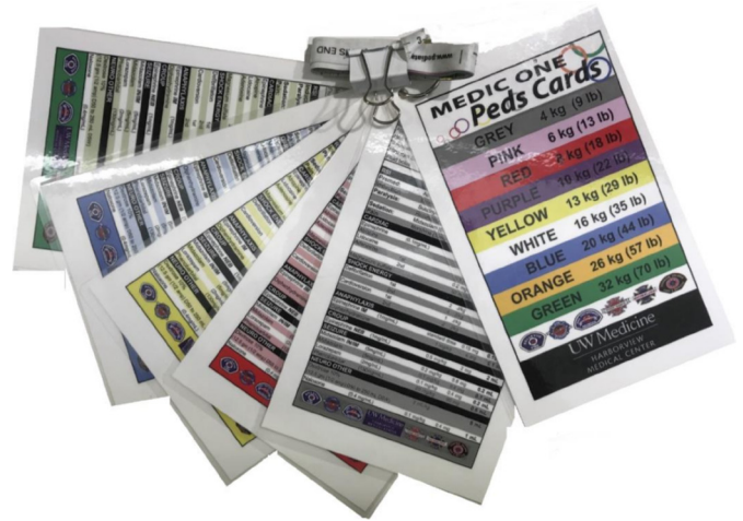
Figure 2 Medic One Pediatric (MOPed) cards.

This working group developed a prototype resource that consisted of colour-coded cards with medication doses chosen by cross-referencing our institution's and Broselow code sheets, PALS recommendations and vetting medication choices with the EMS and paediatric subspecialist group (see figure 2 ). The MOPed cards were