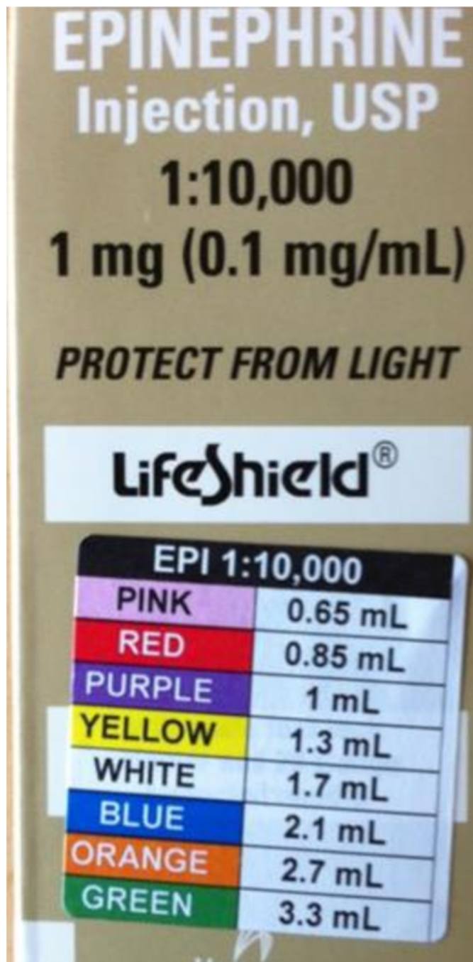
Figure 1 Colour-coded labels on high-risk medications.

the Broselow tape, iPhone ® applications, a King County emergency medical services (EMS) handbook, personal memory and recently implemented colour-coded stickers. In this scenario, we found a wide variation in practice for the determination of epinephrine dosing.