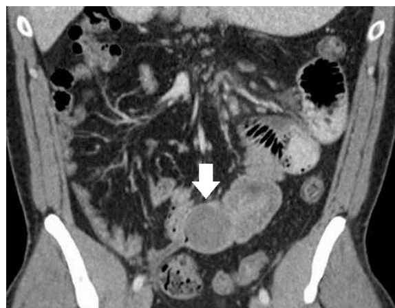
Figure 2. Coronal image: 4cm benign inflammatory polyp (arrow) at the distal intussusceptum, the lesion that served as the lead point for the intussusception.