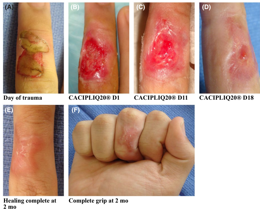
FIGURE 4 Electrical burn. A, Patient 4 was electrocuted instantly on the radial three digits of his right hand, with third-degree burns to the dorsum of his MF measuring 20 mm × 10 mm. B, CACIPLIQ20 ® was started 24 d after the trauma occurred. C, Healing was observed within a week as seen by the formulation of granulation tissue and by Day 11 the wound was half its size. D, Wound closed by D18. E and F, Healing was complete and full range of motion with strong grip was achieved by 2 mo of application

(Figure 3B), which would have taken at least 4 weeks to heal. 15 It was decided to start CACIPLIQ20 ® the next day because his pain tolerance was low (VAS—visual analog score—of 7) and conventional treatments had failed. One week after application, improvement (Figure 3C) and pain relief were already felt by the patient. Within 2 weeks of commencing CACIPLIQ20 ® , the patient's VAS score dropped from 7 to 4 and the wound size had reduced to 5 mm by 5 mm (Figure 3D). All of his wounds dried up by day 17 of application.