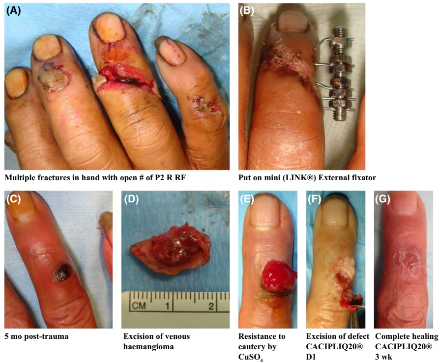
FIGURE 2 Chemical cauterization of granulation tissue. A, An outstation lorry business owner sustained an open fracture of his R RF as part of multiple injuries to his right hand after it was hit by a steel tire rim. B, A mini external fixator was applied, and it went on to heal. C, 5 mo post-trauma, he developed a venous hemangioma. D, This was excised with clear margins. E, Excessive granulation tissue occupied the defect and was resistant to cauterization by copper sulfate (CuSO 4 ). F, Excision was done, and the 4 mm deep defect treated with CACIPLIQ 20®. G, Complete healing in 3 wk

(metacarpophalangeal MP joint), which is unusual in burn contracture cases (Figure 1F).