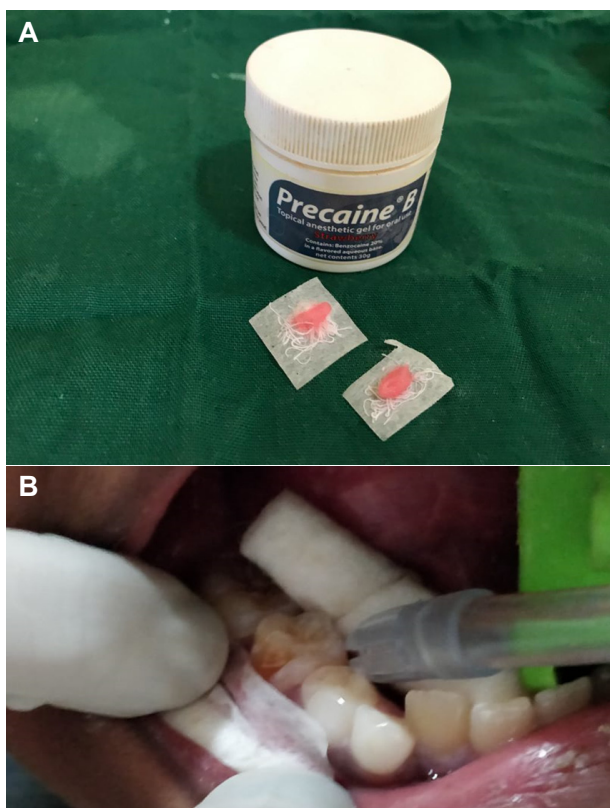
Fig. 2 (A) Topical anesthetic loaded on the prepared transmucosal patch, (B) Transmucosal application of the topical anesthetic