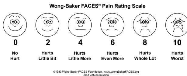
Fig. 3. Wong-Bakers Faces pain rating scale sheet given to the participants for circling the appropriate response after treatment

After achieving adequate anesthesia, crown preparation was performed by the pedodontist. The tooth was occlusally reduced by 1 mm using a pear-shaped diamond bur (FO-32C Dia-burs, MANI Inc., Tochigi, Japan) following the occlusal anatomy of the involved lower primary molar. Proximal slicing was done using a tapered fissure bur (TC-11F Dia-burs, MANI Inc., Tochigi, Japan) to break the contact points and create space for seating the crown. All tooth surfaces were reduced by at least 0.5 mm with a feather edge margin ending 0.5-1 mm subgingivally. Sharp line angles were rounded, and an SSC (KIDS crown, YOGI enterprises, Navi Mumbai, Maharashtra, India) of appropriate size was tried in to obtain a snug fit when seated subgingivally. The tooth preparation took an average of 10 min for all participants. The selected SSC was cemented to the tooth using Type I glass ionomer cement (GC Gold Label 1, GC India