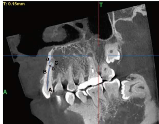
Figure 1. The angle of root canal curvature of maxillary lateral incisors. The angle between the line a and line b was measured.

Measurements were performed using the method of Schneider. [15] The root canal orifice was defined as point A and the root canal foramen was defined as point C. The first line a was scribed from point A parallel to the long axis of canal. The point where the line began to leave the long axis of canal was defined as point B. The second line b was drawn from B to C. Angle of intersection of line a and b was measured and recorded (Fig. 1). The same experimenter measured the root canal curvature according to the above method, and took the average value of 3 measurements to reduce bias between observers. According to the Schneider method, the calculated curvature of root canal can be divided into 3 categories: 0–5 degrees of root canal curvature is category I (also known as basically no curvature), 5–20 degrees of root canal curvature is category II (moderate curvature of root canal), and more than 20 degrees of root canal curvature is category III (severe curvature of root canal). The combination of category II and category III is indicated a curved root canal. If there were more than 2 curves, it was recorded as S-shaped root canal. In consideration of it was