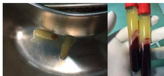
Fig1: Preparation of PRF gel

Prior to the surgery, 20 ml fresh venous blood was taken from each patient and transferred into sterile tubes. As a standard protocol, the tubes were then quickly placed into the Pc-02 table centrifuge (Process, Nice, France), which was adjusted to 3,000 rpm for 10 min (9,11). The tubes were then removed from the centrifuge. Given the lack of anticoagulant in the tubes, there were three distinct layers inside each tube. These layers included platelet-poor plasma at the topmost layer, PRF in the middle zone, and the red blood cells in the lowest layer (9,14) (Fig.1).