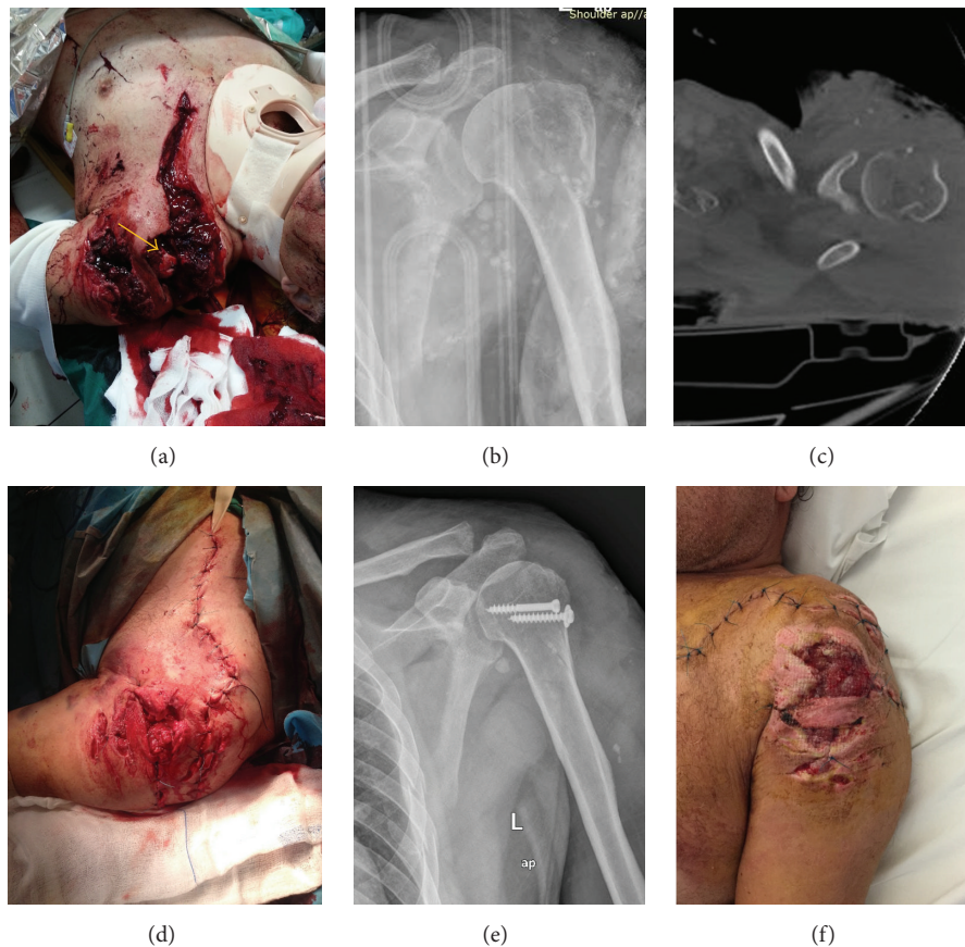
FIGURE 1: (a) Photography of the trauma during patient resuscitation indicated severe, sword-like injury to the left shoulder, with open fracture of the humeral head (arrow). (b) Preoperative anteroposterior X-ray of the left shoulder showing head-splitting fracture of the proximal humerus and presence of multiple foreign bodies (glass). (c) CT scan of the left shoulder indicating involvement of ~30% of the articular surface and the greater tuberosity. (d) Intraoperative picture after muscle and skin closure. (e) Postoperative X-ray of the left shoulder showing adequate reduction of the fragment. (f) Condition of the skin at the 10th postoperative day just before a split skin graft was about to apply.

sutures (Figure 1(d)). Skin has been closed partially and a Penrose drain was applied. From the wound was cultivated E. coli and Staphylococcus warneri . The patient was treated with intravenous antibiotics for 3 weeks and oral administration for another 3 weeks after his discharge. At the 10th postoperative day, the wound showed signs of reepithelialization and a split-thickness skin graft was applied for terminal closure (Figure 1(f)).