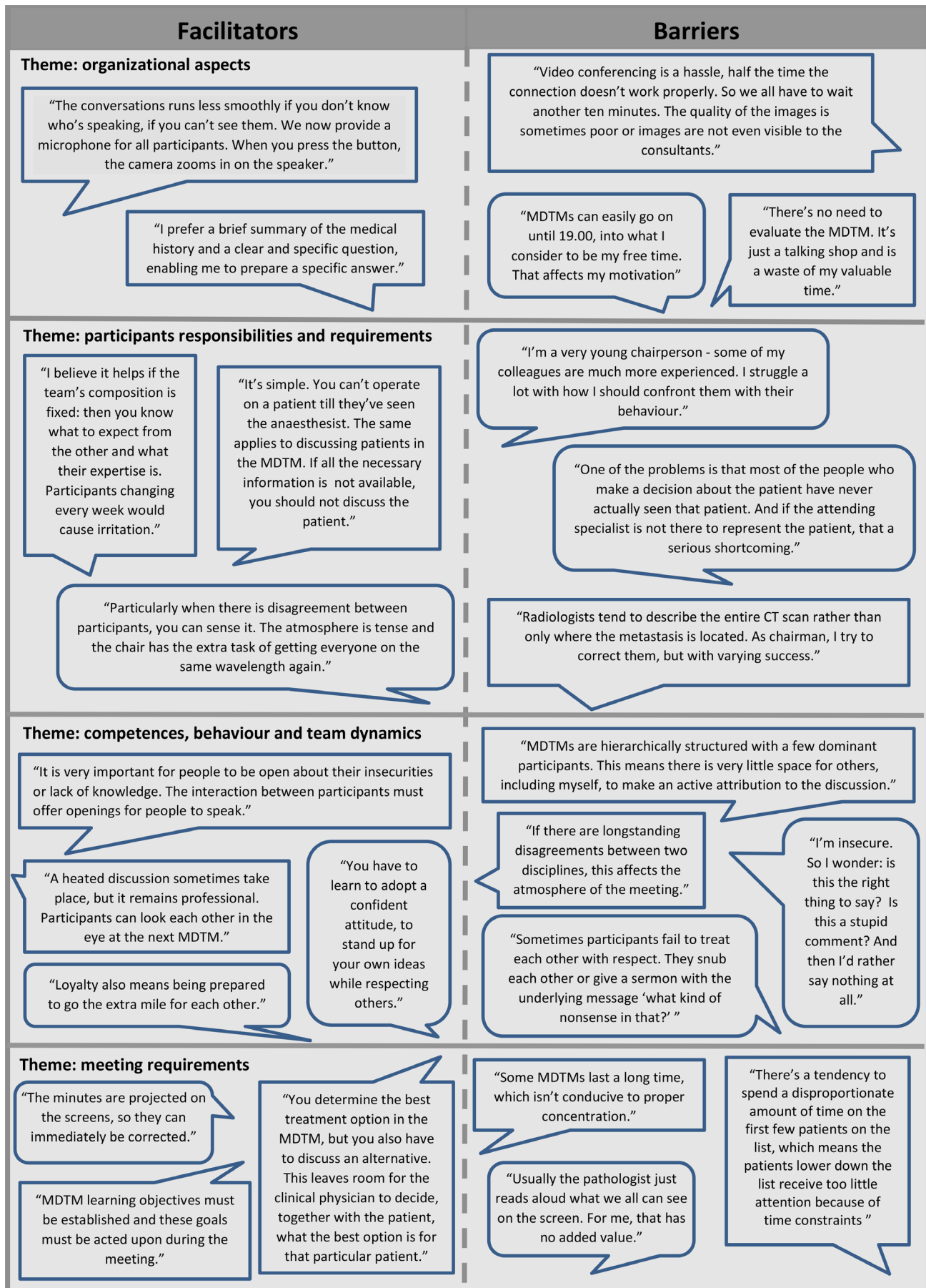
Figure 1 Quotes related to themes impacting the quality of oncologic multidisciplinary team meetings.