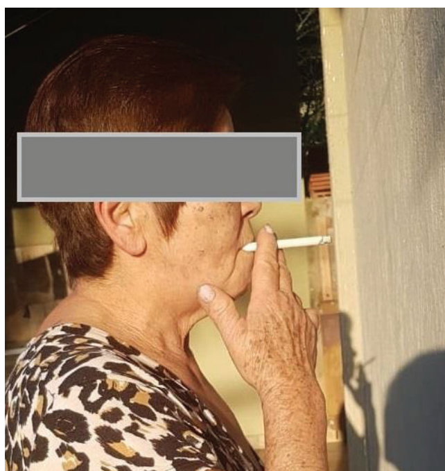
Figure 1. 'Cue Restricted Smoking' position

The primary outcome of the study was continuous