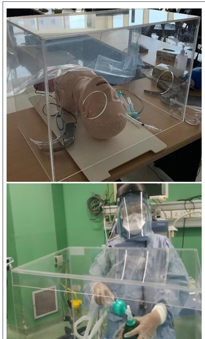
Figure 1. Intubation box used in our study.

The patients were randomly allocated to 2 groups by computer-generated random numbers, depending upon whether a C-MAC VL (Karl Storz, Tuttlingen, Germany) was used (group C, n=30) or McGrath VL (Aircraft Medical Ltd,