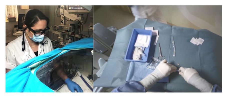
FIGURE 3 Use of the Tobii eye-tracking glasses on the Neonatal Intensive Care Unit (NICU) of the Leiden University Medical Center (LUMC), which give a unique point-of-view recording.

Our department want to continue using video recordings to improve patient care and safety in new ways. Using the insights from this review, we propose a set-up for a future study on the implementation of video-reflection and using it to improve quality of care (Figure 2). The focus of the reflection sessions will be on daily neonatal interventions and their context, on reflecting multidisciplinary instead of individual assessment and on interacting with the members from both medical and nursing staff to retrieve their perspective. We use eye-tracking