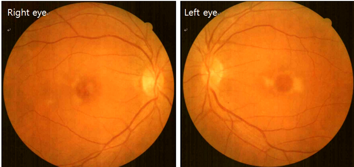
Fig. 1. Yellow-white lesions around fovea are shown in both eyes.