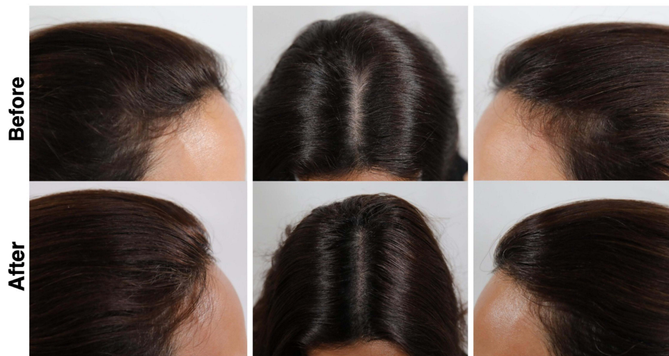
Figure 2 Pre- and post ADSC-CM clinical photography of a 39-year-old female patient showing an aesthetic improvement of the midline and bitemporal areas. The figures have been used with written consent of the patient.