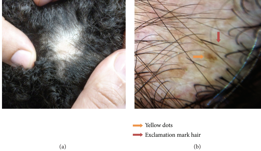
FIGURE 2: Alopecia areata (a) macroscopic view, (b) trichoscopic view at 40x magnification, shows yellow dots (orange arrow) and exclamation mark hair (pink arrow).